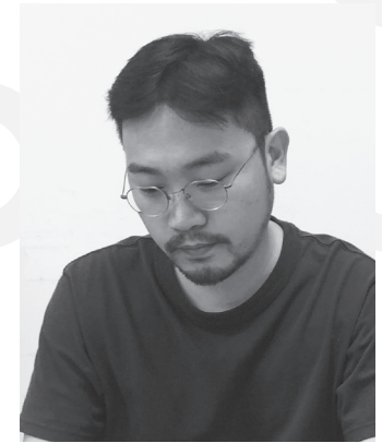
Hyunwoo Chong Graphic Design