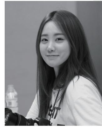
Eva Dream Graphic Design