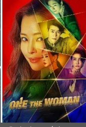
Revenge/female solidarity/villainess crime/thriller